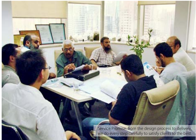
Service Promise: from the design process to delivery, we do every step carefully to satisfy clients to the best.

Since the establishment, Shanghai Shibang Machinery Co., Ltd has regarded "All is for clients" as its service goal and has provided high-quality, high-taste, high-efficient and all-around-way service for its clients.